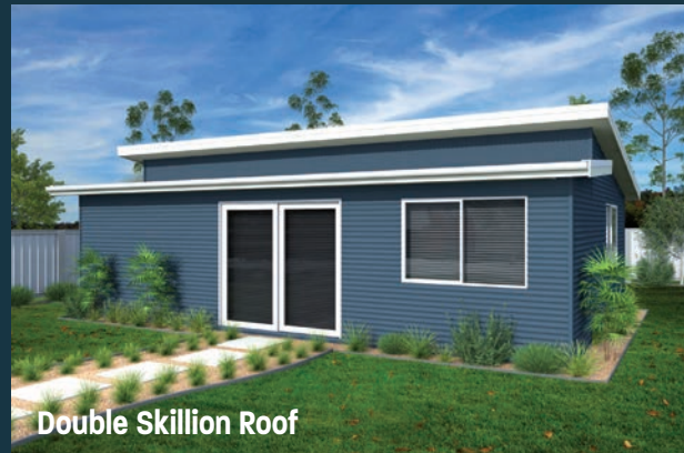
Double Skillion Roof