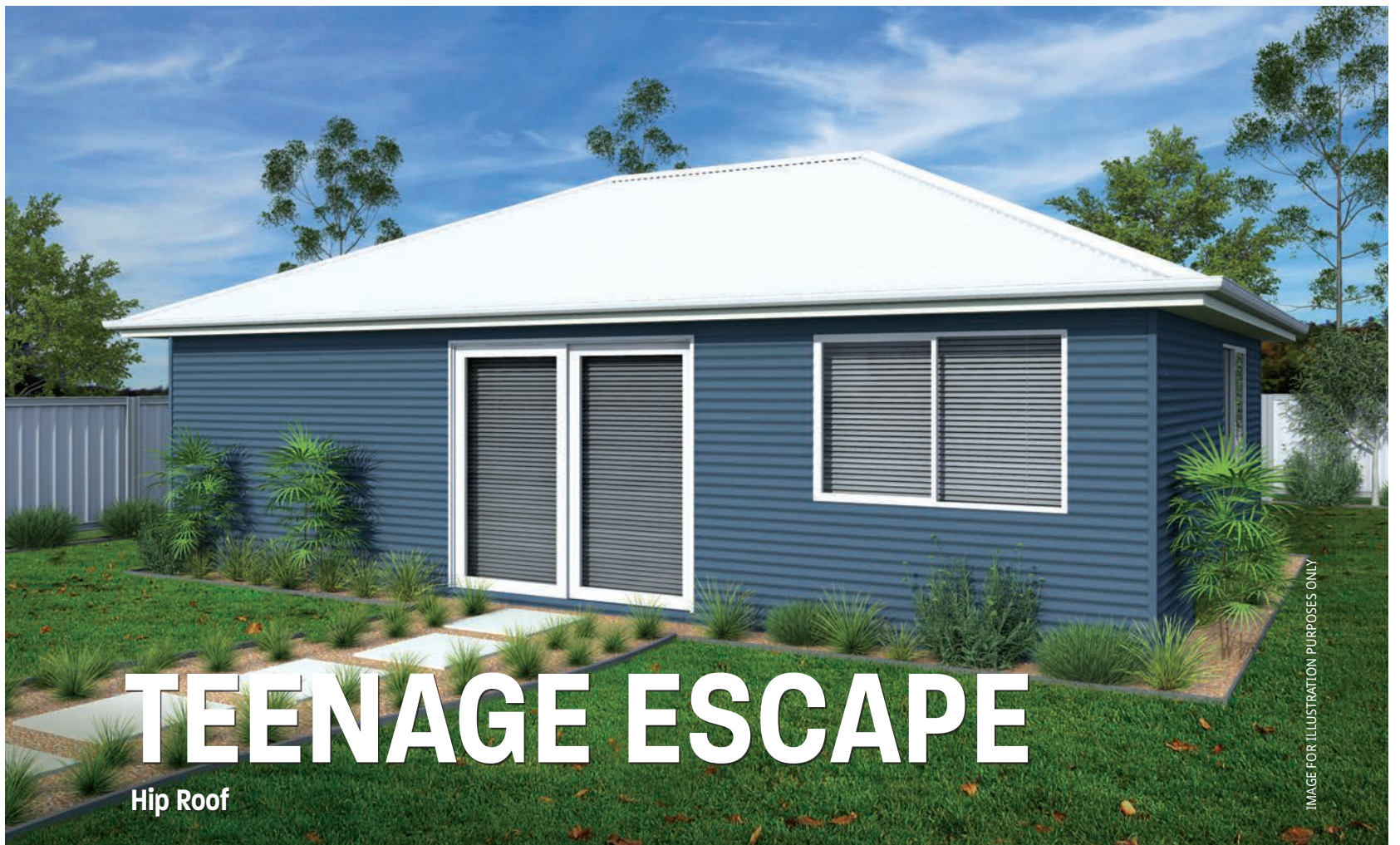
IMAGE FOR ILLUSTRATION PURPOSES ONLY